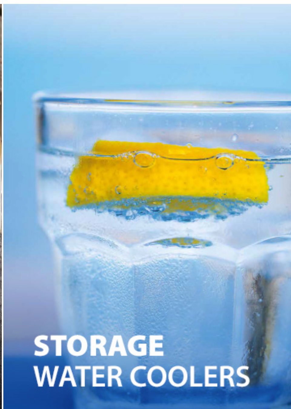
STORAGE WATER COOLERS