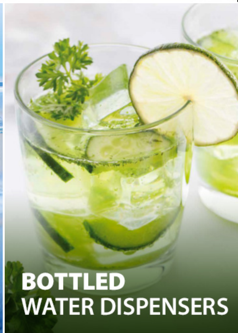
BOTTLED WATER DISPENSERS